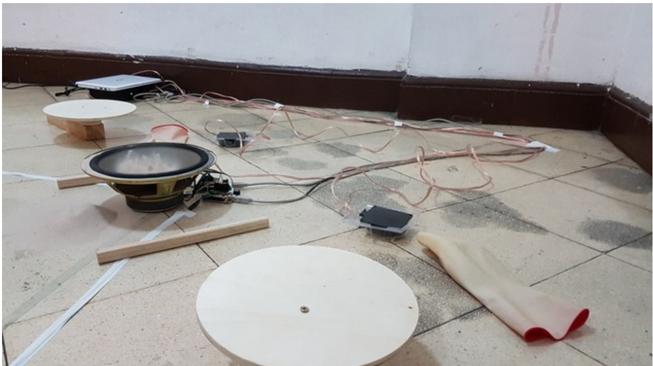
Zona Escena | Baquerizo Moreno 519 y Mendiburo – Exhibition