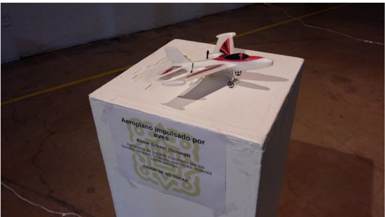
Centro Educativo y Cultural del Estado de Quéretaro "Manuel Gómez Morín"