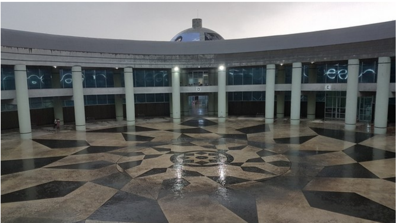
Centro Educativo y Cultural del Estado de Querétaro "Manuel Gómez Morín"

In Querétaro, the CC "Manuel Gómez Morín" director's wants to expand our collaboration for the next year. We also did a very interesting link with another of our partners there, the Laboratorio Nacional de Visualización Científica from UNAM (Autonomous Mexican University). They want to explore the possibility to do a program of residencies in collaboration with Piksel.