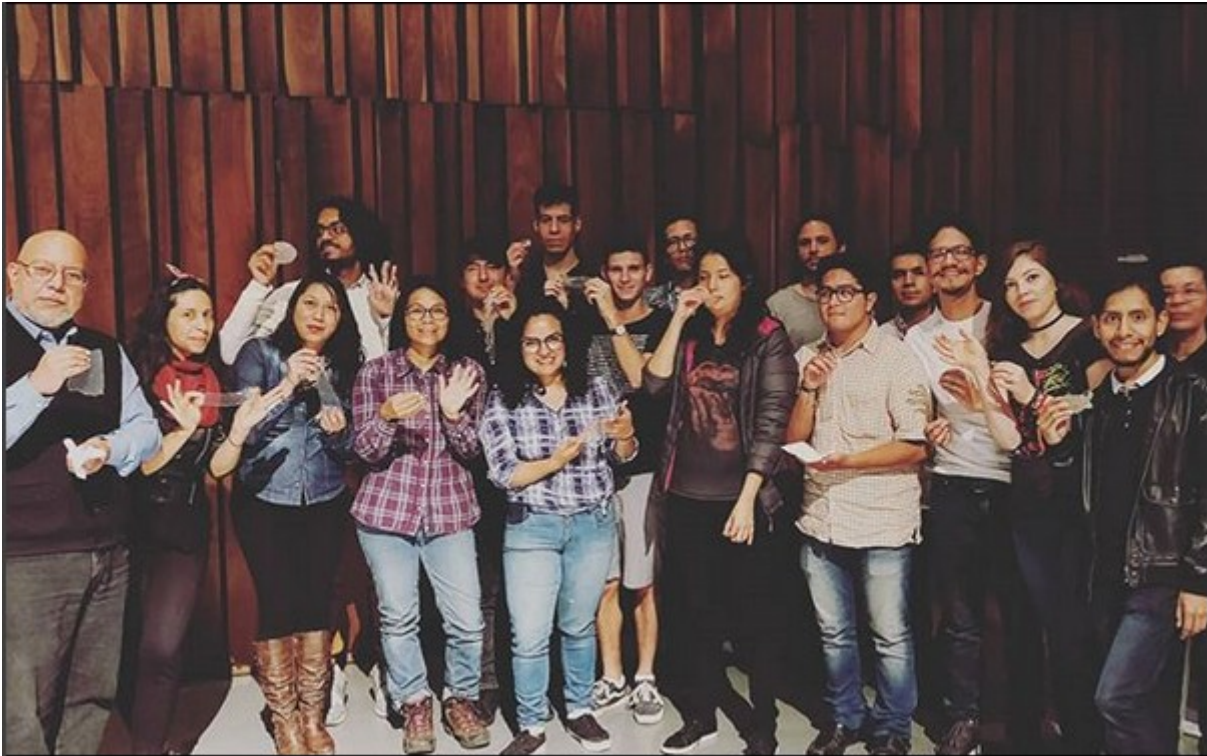
CC CULTURAL DE ESPAÑA - WORKSHOP

Strandgaten 207, 5004 Bergen, Norway 47 90665018 info@piksel.no www.piksel.no