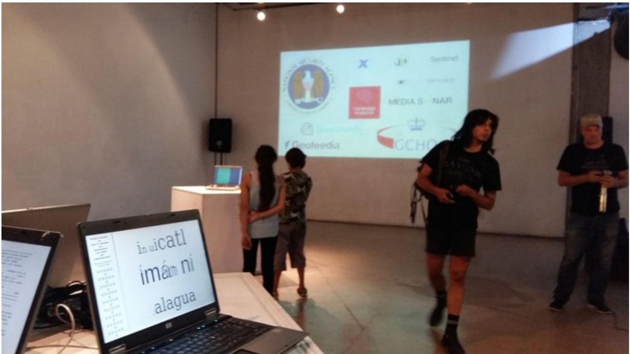
Centro Educativo y Cultural del Estado de Querétaro "Manuel Gómez Morín"

Strandgaten 207, 5004 Bergen, Norway 47 90665018 info@piksel.no www.piksel.no