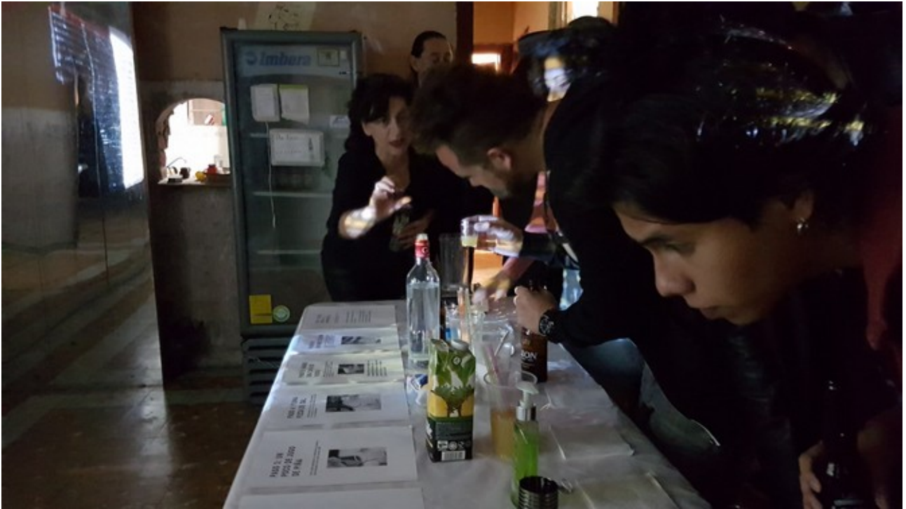
LOS 14 EXHIBITION

Strandgaten 207, 5004 Bergen, Norway 47 90665018 info@piksel.no www.piksel.no