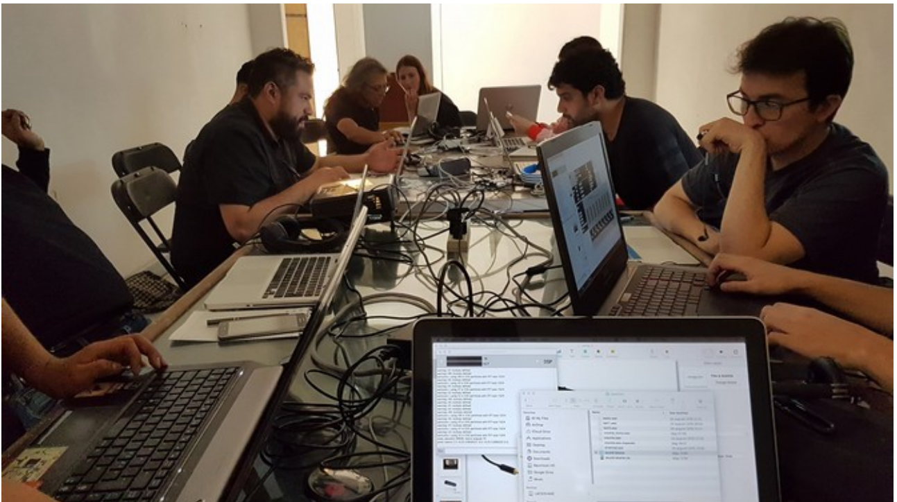
LOS 14 - WORKSHOP