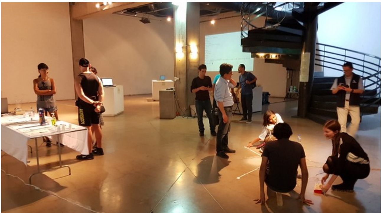
Centro Educativo y Cultural del Estado de Quéretaro "Manuel Gómez Morín"