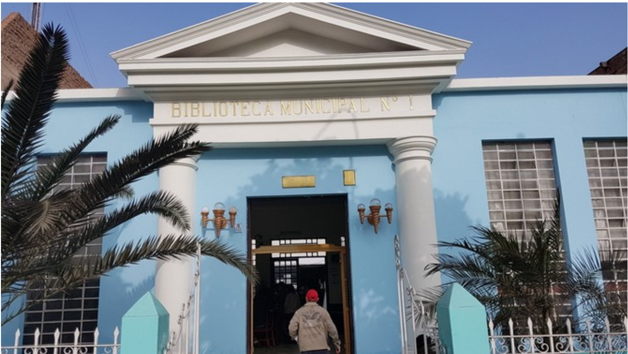
City Lybrary – Workshops

Strandgaten 207, 5004 Bergen, Norway 47 90665018 info@piksel.no www.piksel.no