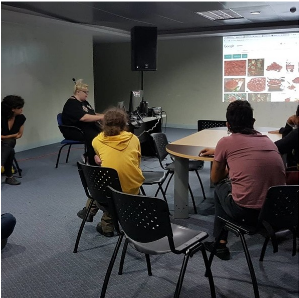
Universidad de las Artes, Campus Sur | Av. Quito y Bolivia – Workshops - Biolab

For the participants has also been very important the expanding of their artistic scenes and their researches, the eco-bio view has been very much studied from some of the TransPiksel artists. Southern countries have become real new arenas where to explore and produce new works and projects.