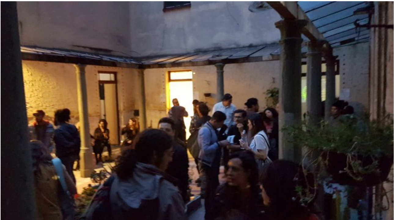
LOS 14 EXHIBITION OPENING

From 11 th to 15 th of July TransPiksel took place in Ciudad de México.