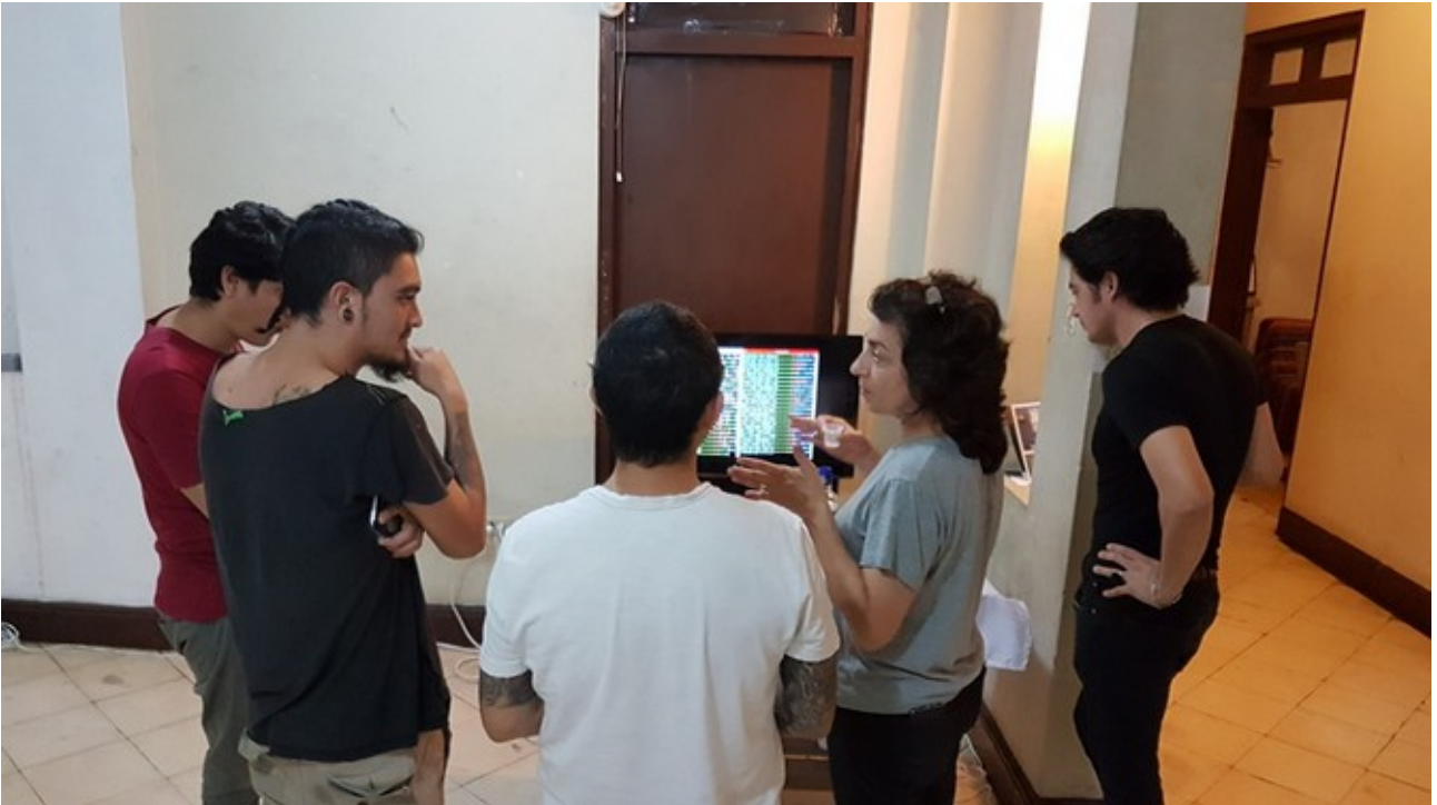
Zona Escena | Baquerizo Moreno 519 y Mendiburo – Exhibition

Strandgaten 207, 5004 Bergen, Norway 47 90665018 info@piksel.no www.piksel.no