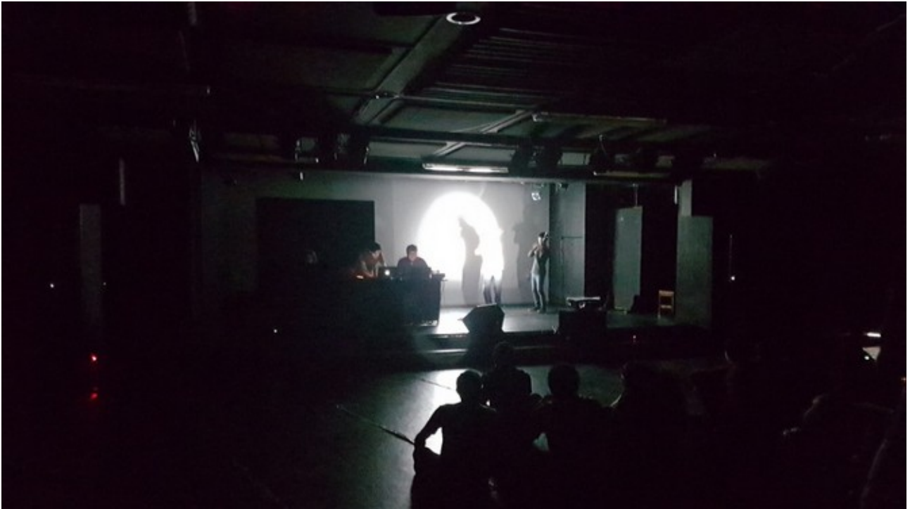
Universidad de las Artes, Campus Sur | Av. Quito y Bolivia - Concerts

Strandgaten 207, 5004 Bergen, Norway 47 90665018 info@piksel.no www.piksel.no