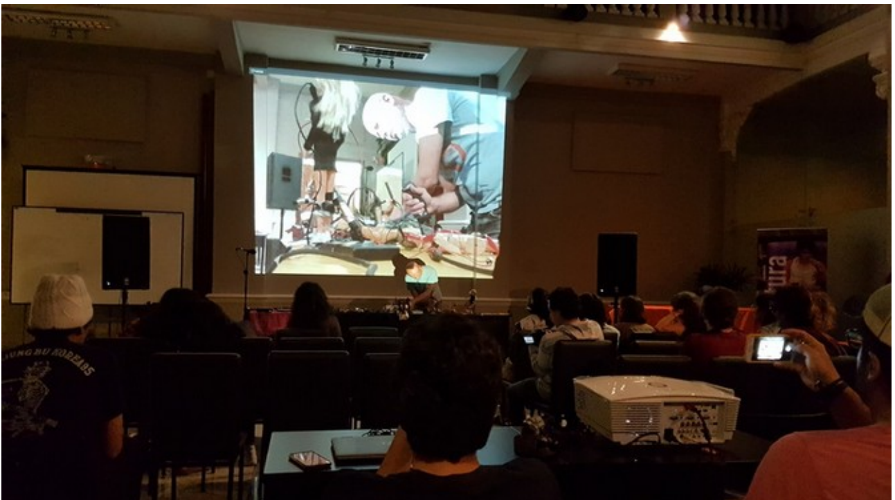
Universidad de las Artes, Campus Centro | Malecón Simón Bolívar y Aguirre