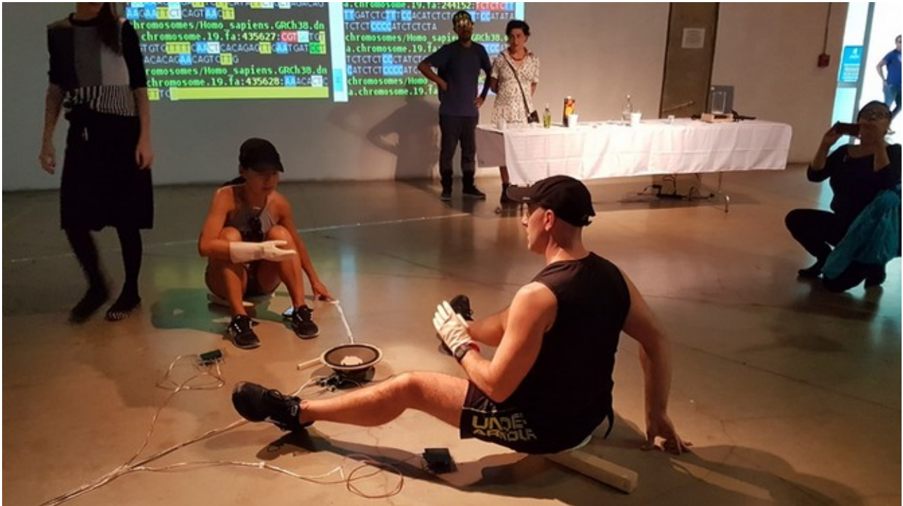
Centro Educativo y Cultural del Estado de Quéretaro "Manuel Gómez Morín"

Local partners have opened their networks and met all needs about venues, exhibitions, workshops and technical equipments. Also they have introduced us to stakeholders of interest on each country. This collaboration has been highly productive and motivating.