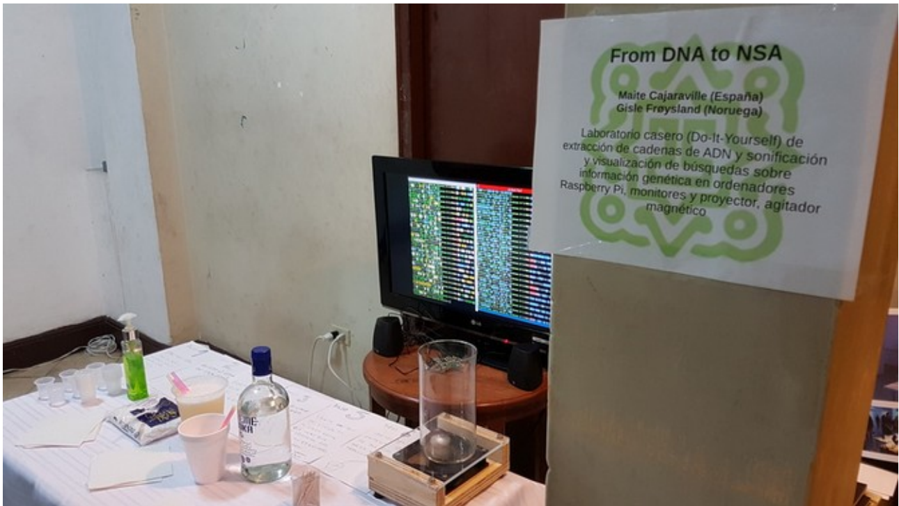
Zona Escena | Baquerizo Moreno 519 y Mendiburo – Exhibition