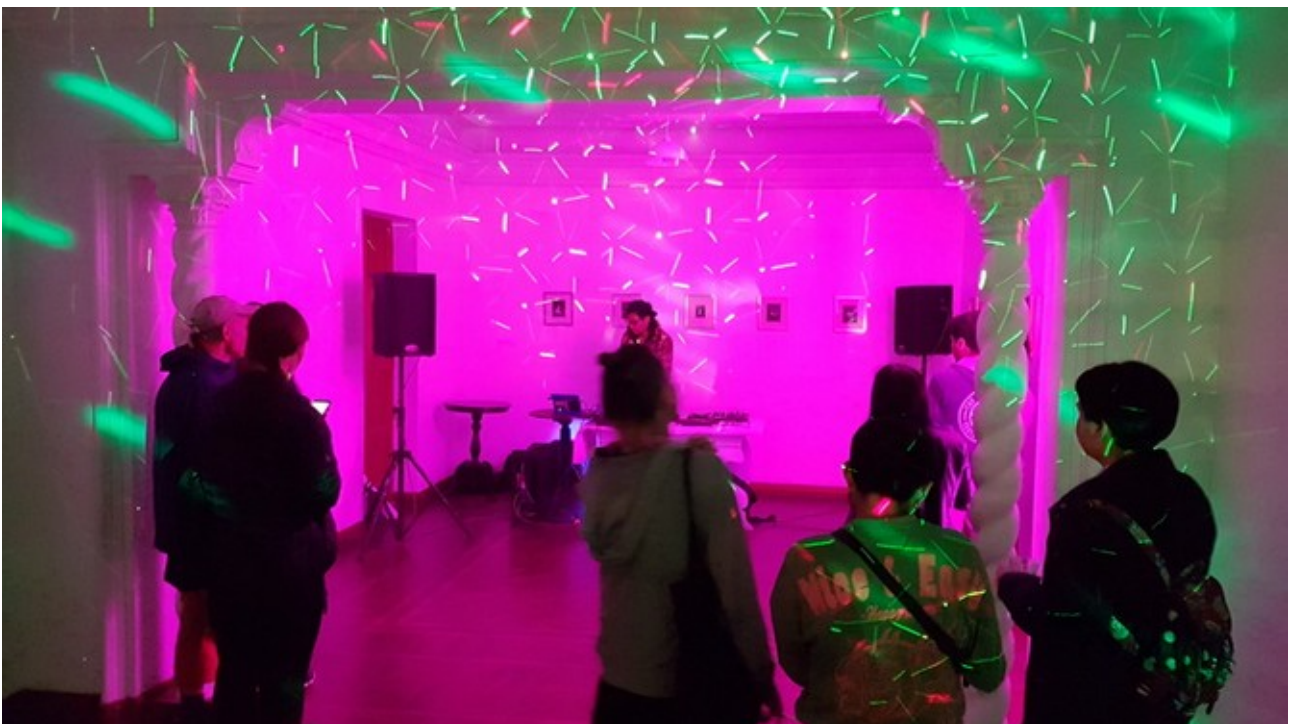
El Patio Rojo – Exhibitions and concerts