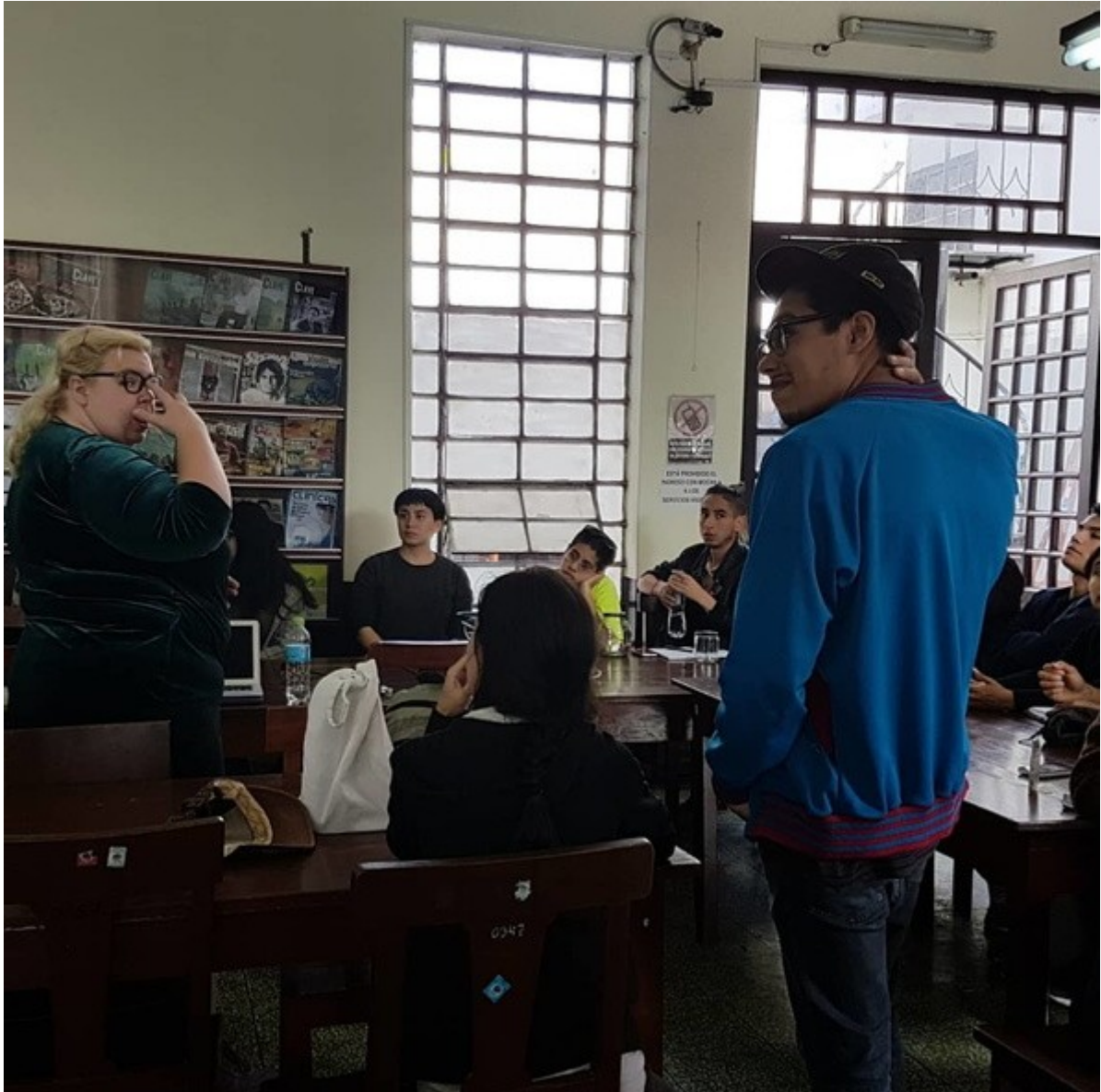
City Lybrary - Workshops

audience figures on this third edition comparatively with the ones before.