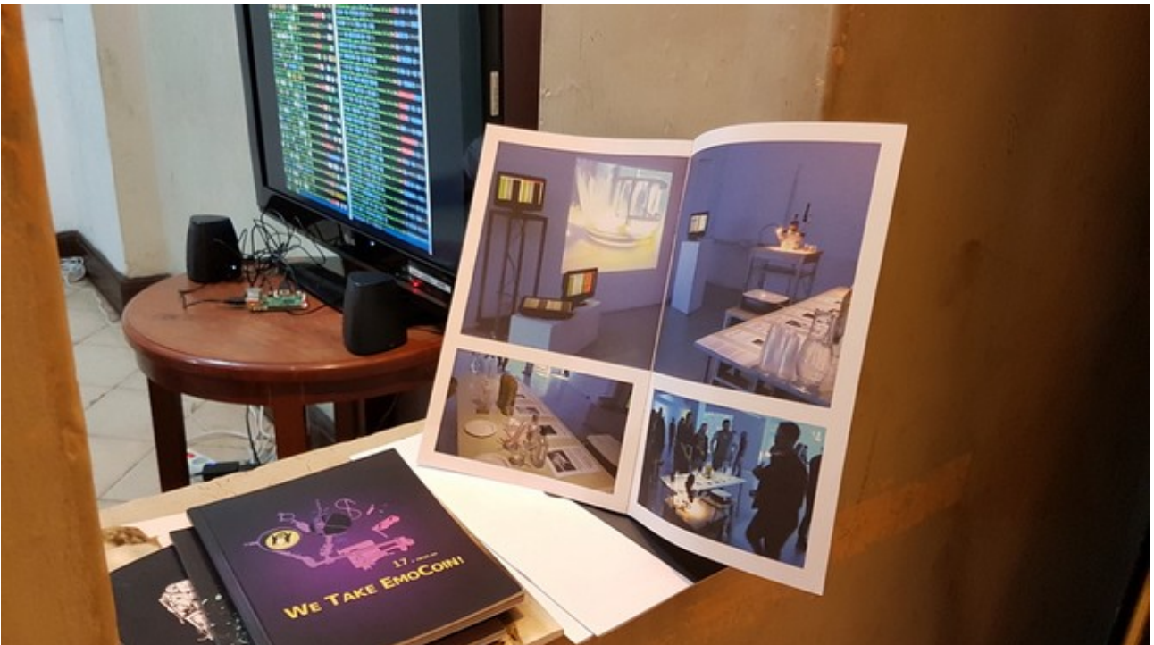
Zona Escena | Baquerizo Moreno 519 y Mendiburo – Exhibition